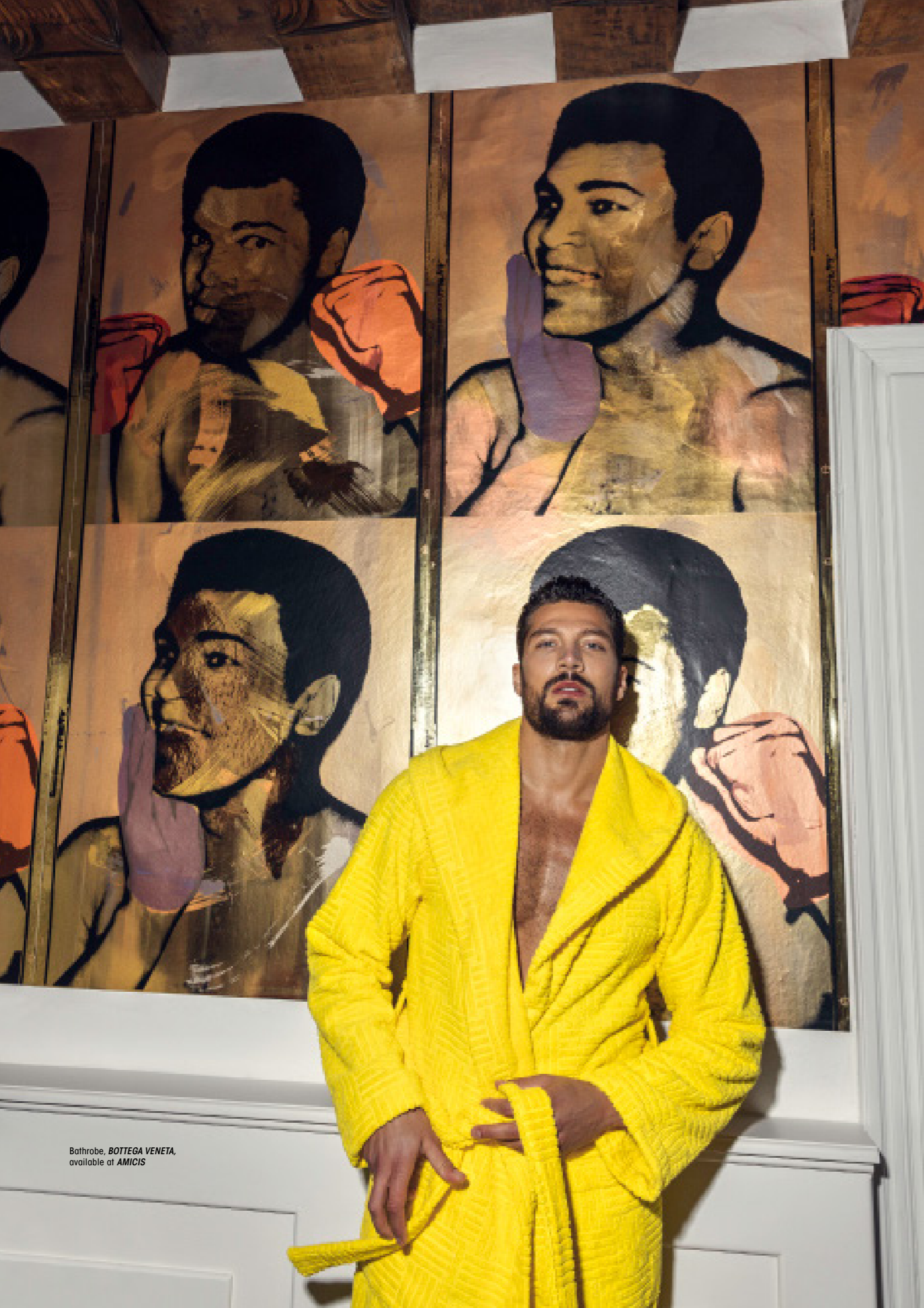
Bathrobe, BOTTEGA VENETA , available at AMICIS