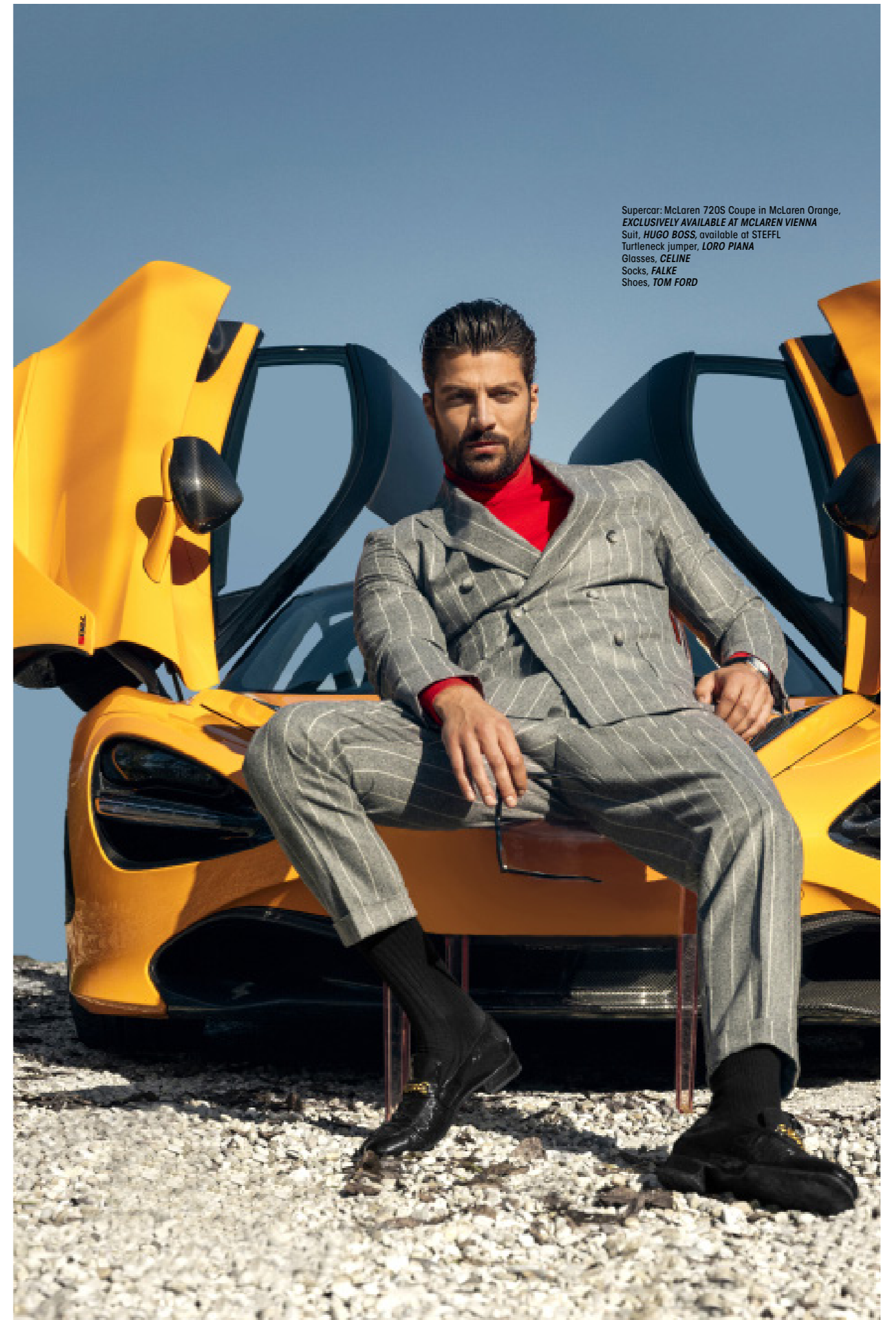
Supercar: McLaren 720S Coupe in McLaren Orange, EXCLUSIVELY AVAILABLE AT MCLAREN VIENNA Suit, HUGO BOSS , available at STEFFL Turtleneck jumper, LORO PIANA Glasses, CELINE Socks, FALKE Shoes, TOM FORD