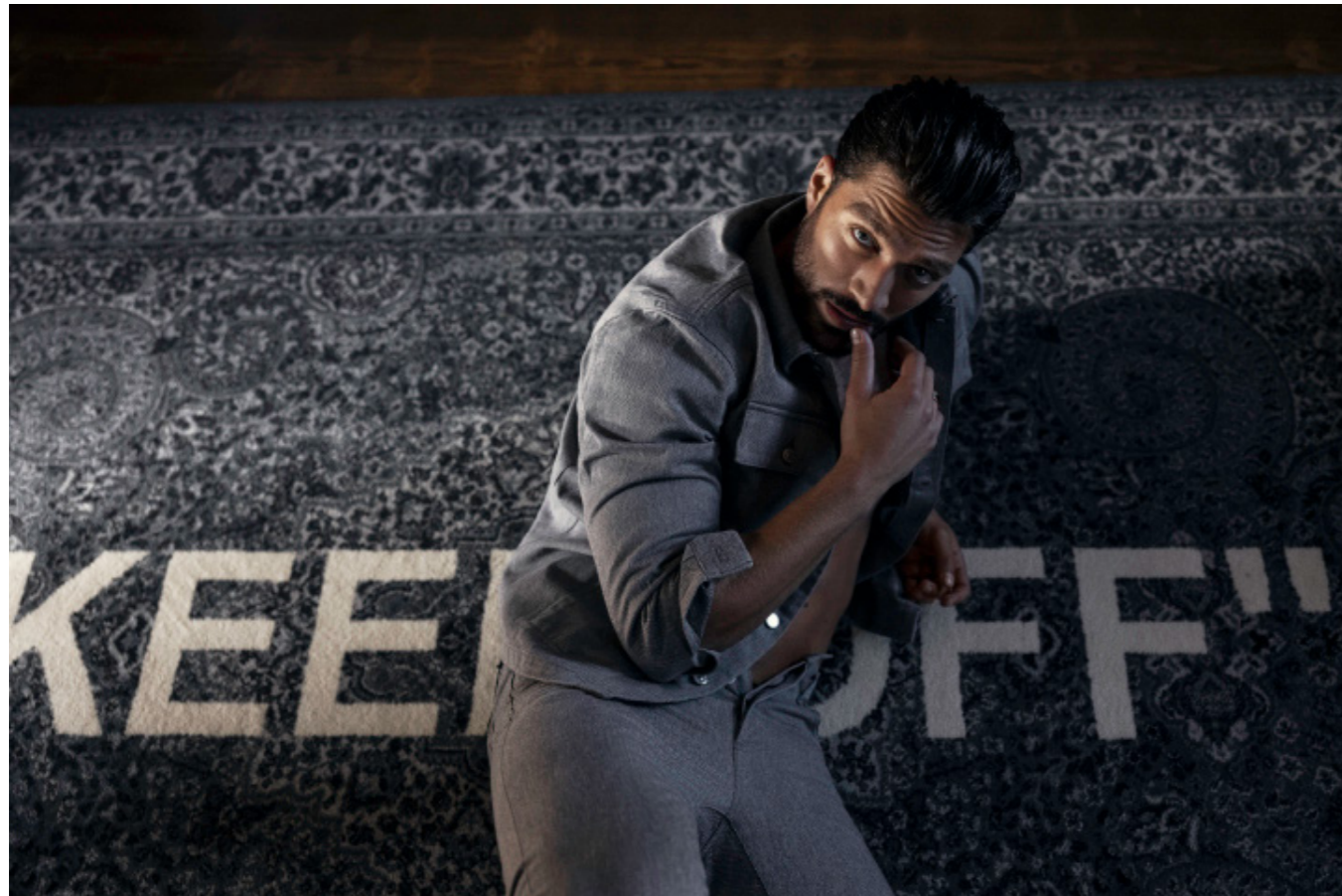
Jacket and trousers, DIOR HOMMES , available at AMICIS