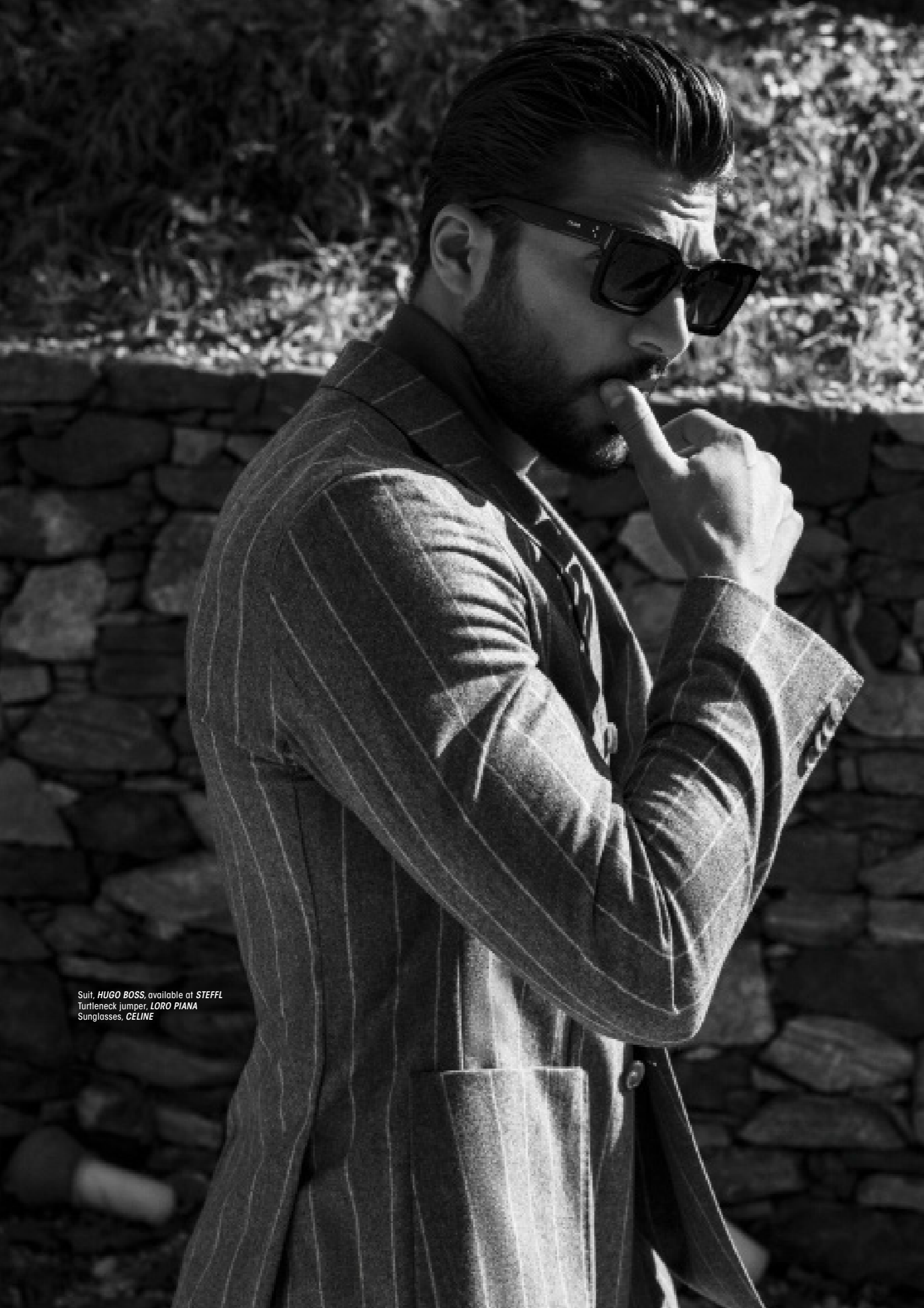
Suit, HUGO BOSS , available at STEFFL Turtleneck jumper, LORO PIANA Sunglasses, CELINE