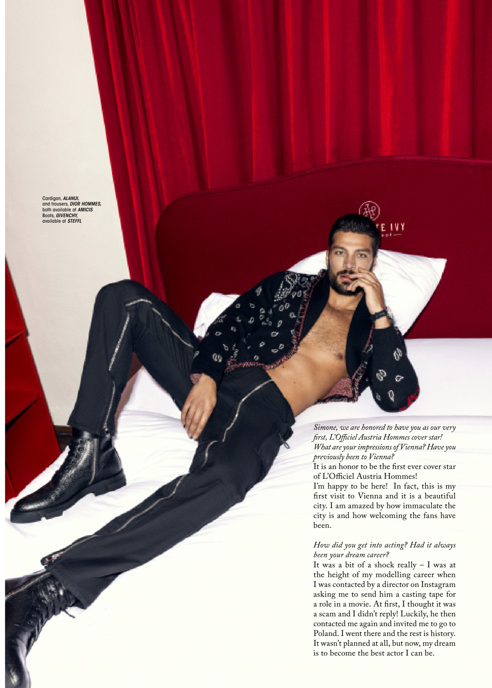
Cardigan, ALANUI , and trousers, DIOR HOMMES , both available at AMICIS Boots, GIVENCHY , available at STEFFL