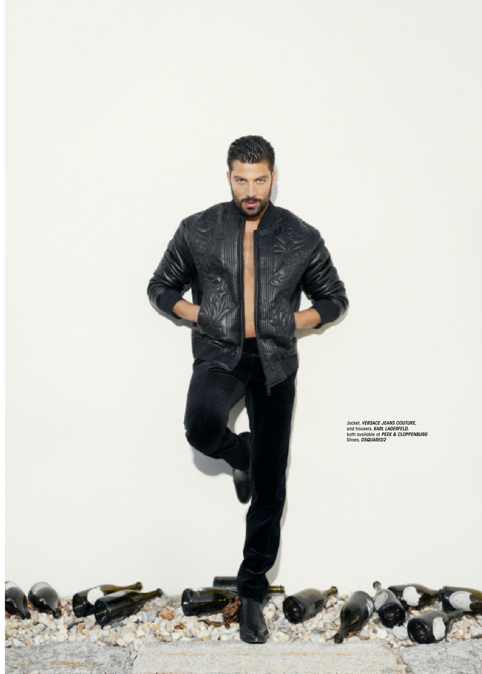
Jacket, VERSACE JEANS COUTURE , and trousers, KARL LAGERFELD , both available at PEEK & CLOPPENBURG Shoes, DSQUARED2