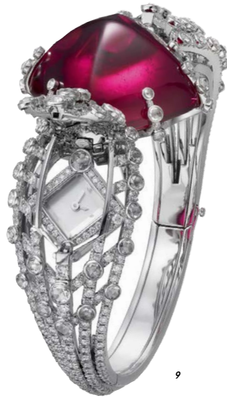
7. HPI00604 secret watch bracelet, CARTIER 8. HPI00917 secret watch bracelet, CARTIER 9. HPI01320 Desert Rose secret watch, CARTIER 10. Caméléon secret watch, CARTIER

quartz and kite-shaped diamonds to the “Caméléon” secret watch made from white gold, one 16.18-carat roundshaped faceted green tourmaline, and cabochon-cut tourmalines, turquoise, onyx, triangular-shaped emerald, briolette-cut sapphire crystal, brilliant-cut diamonds with a quartz movement – Cartier has many a secret treasure buried amongst years of artisan creations.